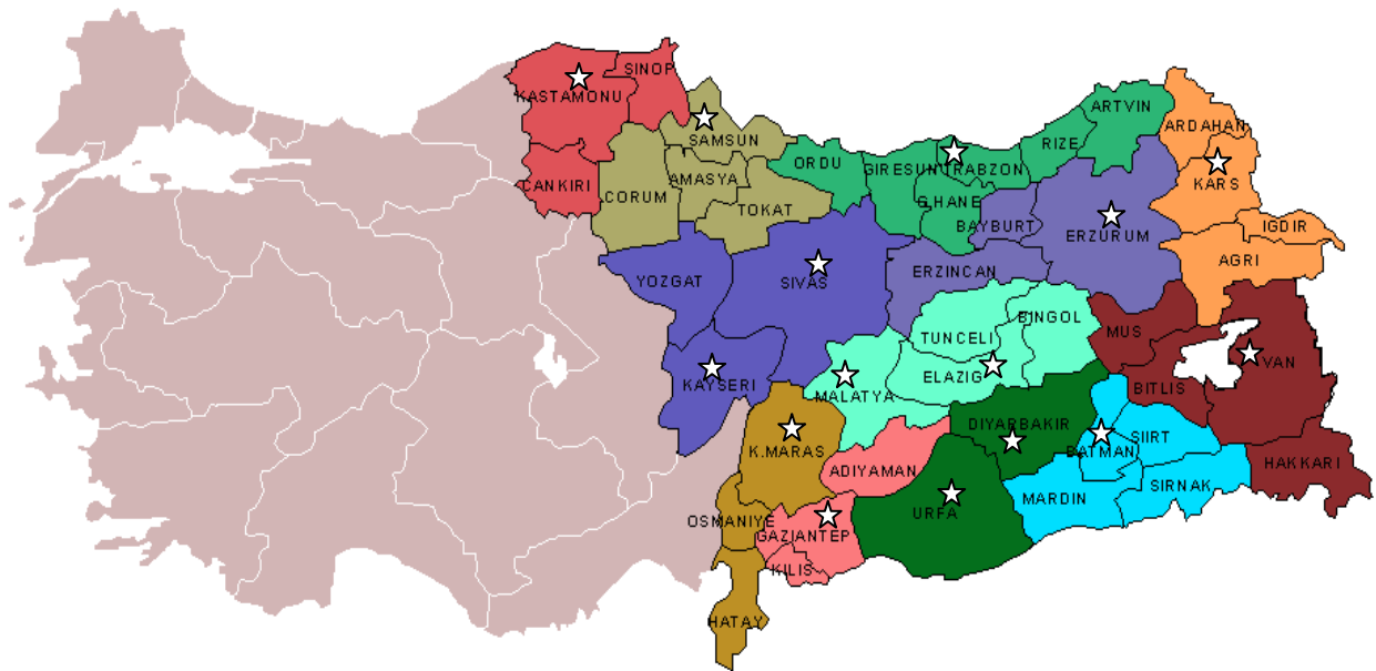
Map 1: Eligible 12 NUTS II Regions and 15 Growth Centers (White stars reflects the Growth Centers)

On the other hand, in terms of sectoral concentration, the Programme concentrates on SMEs, operating in manufacturing industry and tourism sectors, information society, research and development and innovation.